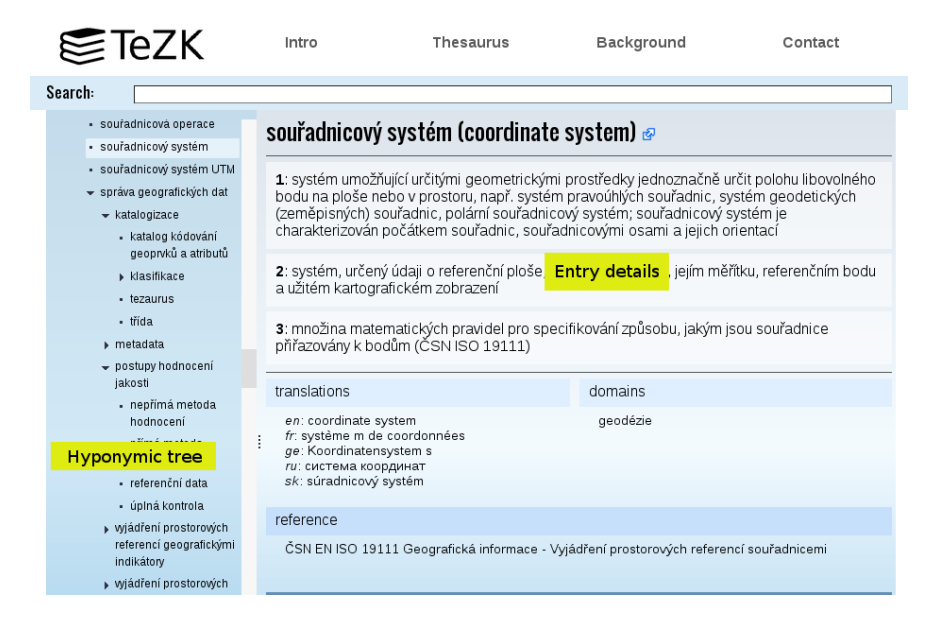
Fig. 2: Browsing the thesaurus, with detailed information for one term.

of words and named-entities in the specialized corpora are compared to the frequencies of the same phrases in a general language corpus (in this case, the biggest Czech corpus developed in NLPC – czTenTen12 [6]). The best candidate terms have the highest frequency quotient [7].